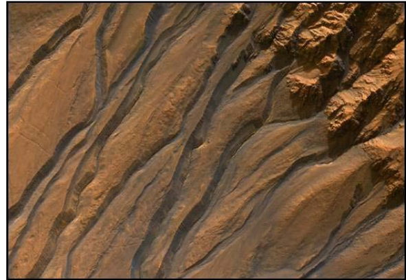
Fig. 1. Martian gullies. Surface features suggest the possibility that water has previously flowed on the surface of Mars.

Instrument Design: It is widely established that OSL dating techniques can be adapted for utilization on Mars. Main design constraints taken into consideration for all instrument systems on spacecrafts are low power, low weight, low volume and valuable data acquisition. An ideal instrument for OSL dating would only require several watts of power, weigh only a few kilograms and it would be packaged into a container with a volume of about 15 x 20 x 20 cm 3 . (McKeever et. al., 2003)