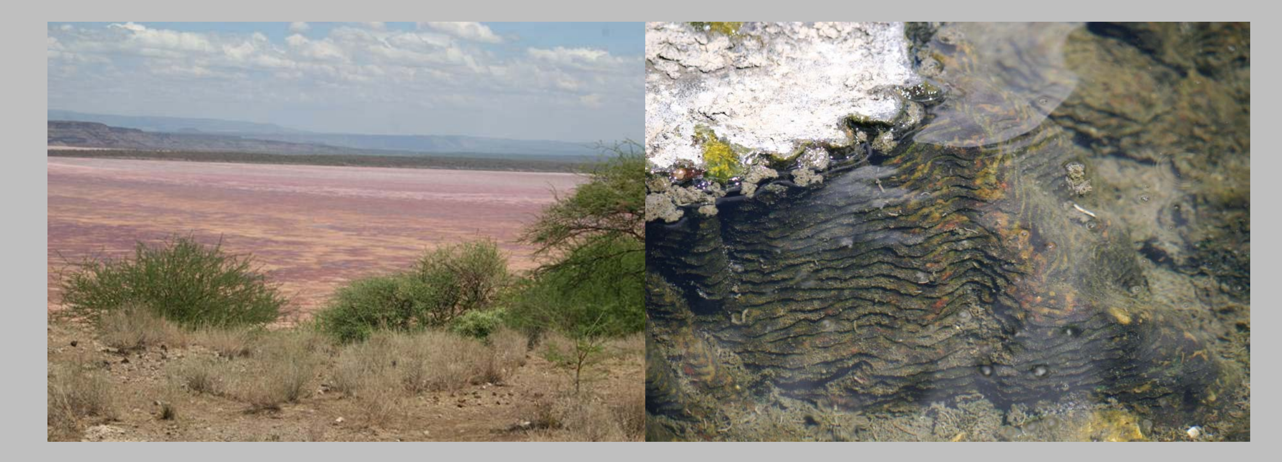
Figure 1. Lake Magadi Kenya, (left) pink coloration of the lake due to halophilic Euryarcheaota, (right) textured evaporite structure within a hot spring within the Magadi basin.

thermal feature and the initial phylogenetic placement of the archaeal monoammonium oxygenase (subunit amoA) from this location.